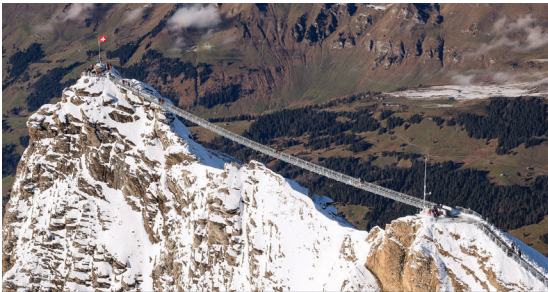
5. VIEW POINT – PEAK WALK BY TISSOT