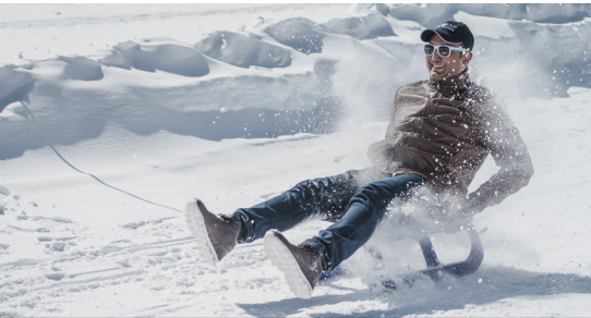
2. FUN PARK