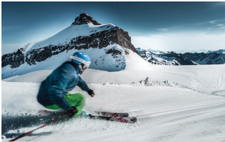
28 KM OF SLOPES

Unique glacier ski area at an altitude of 3,000 m from October to May