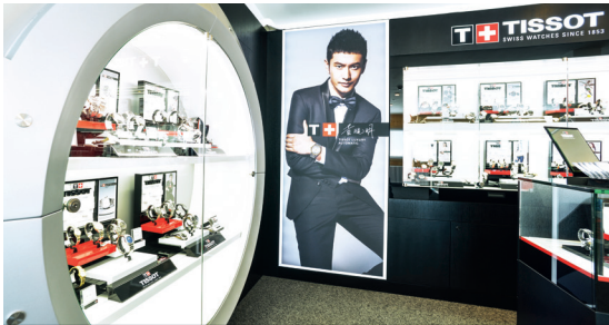
4. WATCH & SOUVENIR SHOP