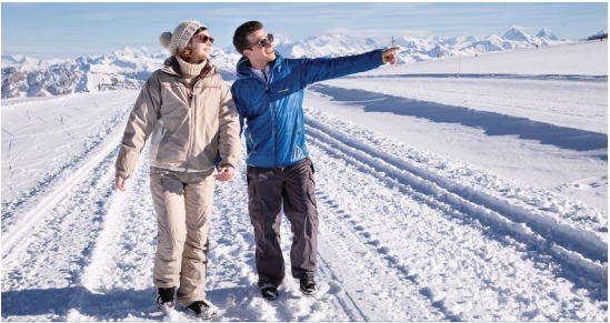
8. GLACIER WALK