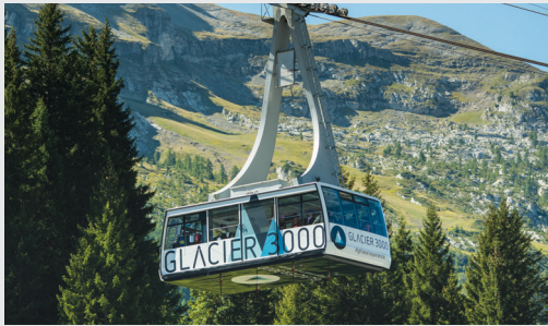
Cable car ride of 15 minutes, 1 change, 125 persons per cable car, first ascent at 9 am, courses every 20 minutes.