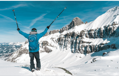
NEW RED RUN SLOPE

High alpine terrain with countless routes