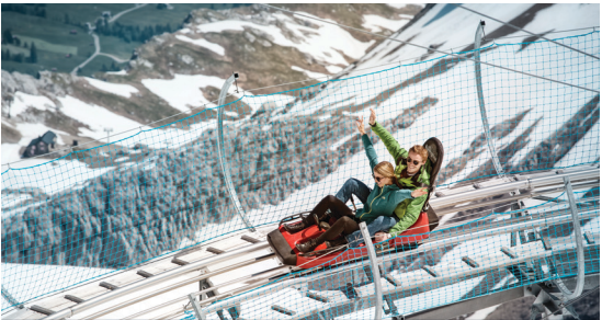
6. ALPINE COASTER