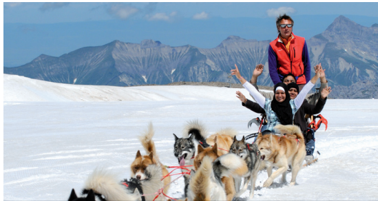
3. DOG SLED RIDE