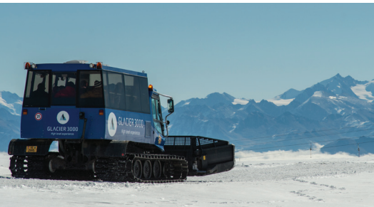
1. SNOW BUS